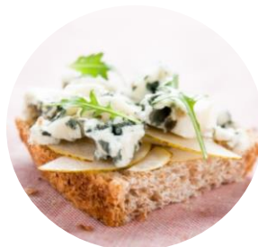
Toasts with pears and cheese